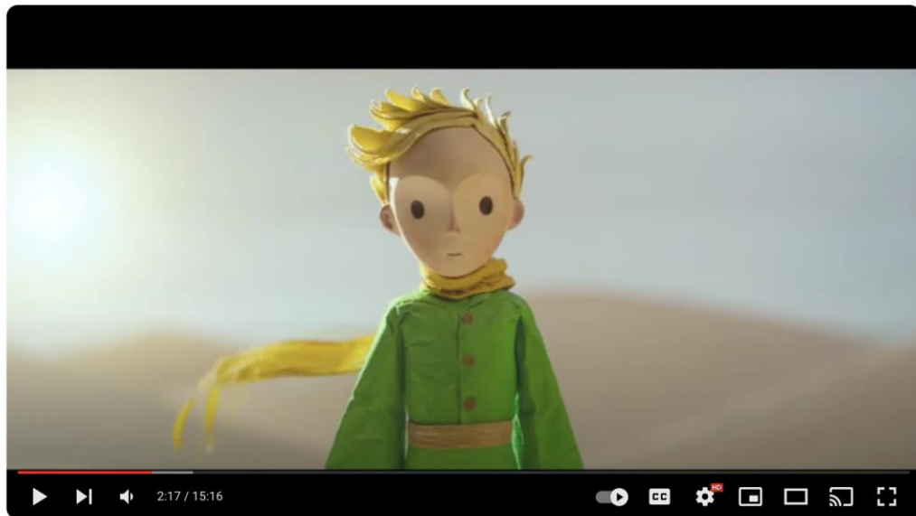
The Little Prince - A Children's Story for Adults